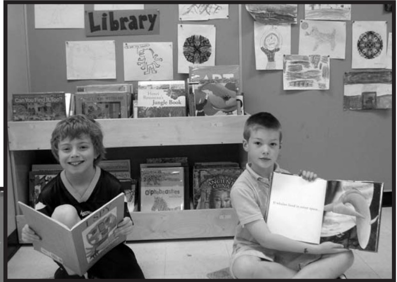
READING TO LEARN IN ART – Central Park